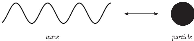
Figure 1. Wave-particle duality

Niels Bohr in 1913 and the confirmation of X-ray photons that behaved like particles with momentum \frac{h\nu}{c} 47 by Compton in 1923. These three breakthroughs confirm that on a microscopic scale waves can behave like particles. 48 In 1923 also de Broglie postulated that not only waves behave like particles, but also vice versa, particles can behave like waves. This concept was only confirmed experimentally in 1927 by Davisson and Germer; they showed that forms of interference, a property of waves, could be obtained with material particles such as electrons. Finally it is clear that on a microscopic scale, classical physics fails not only quantitatively but even qualitatively and conceptually. 49