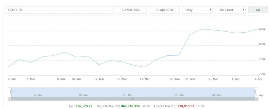
Graph 2. Gold Price Data in Rupiah

One of the causes of the weakening of the IHSG was because investors fled their money from risky investment instruments such as the Indonesian Rupiah (IDR) and IHSG to safe assets or safe haven such as gold to secure funds and avoid losses. It can be seen in the following graph, that gold prices fluctuated and experienced significant increases during the Covid-19 pandemic.