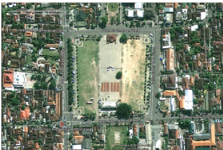
Figure 5. The city centre of Ponorogo

Similarly, the current Ponorogo city centre, still reflecting the concept of Islamic settlements, consists of the central government (district government building), business centre (market), the centre of worship (mosque), and green open space (city square). This model is a typical Islamic concept in Java that accommodates the needs of worship, accommodates the necessities of life and socializes with other another human, and harmonizes with nature.