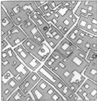
Figure 1. The old city of Kuwait.