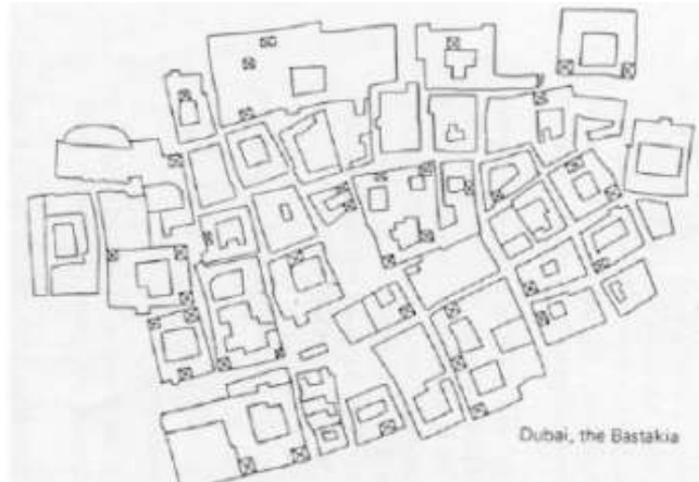
Figure 2. The old city of Dubai.

Furthermore, Saoud (2002) also gives an explanation about the morphological components of the Islamic settlement or city using the common broad consensus among scholars that the Islamic settlement or city has the following (typical) features: