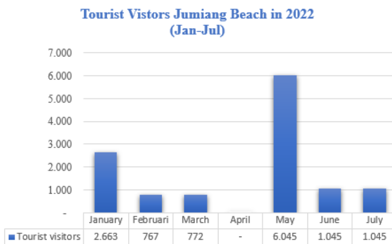
Figure 2 Tourist Visitors Data Jumiang Beach Period Jan-Jul 2022 (DISPORAPAR KAB. PAMEKASAN, 2022)

From this potential, it becomes a characteristic and uniqueness of Jumiang Beach. Evidenced by the existence of this potential, Jumiang Beach is one of the tourist destinations that are of interest to tourists.