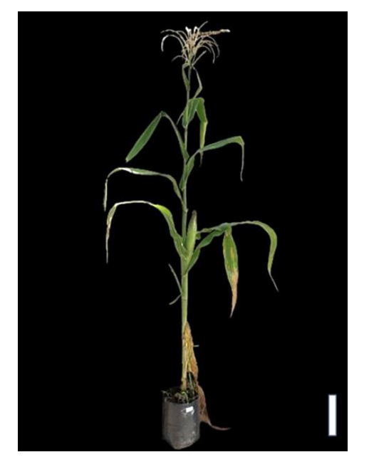
Figure 1. Mature corn (Sweet corn) cv Bimmo in an early reproductive phase at 70 DAP. White bar = 0,88 cm

Maize response towards water depletion in soil or planting medium can be categorized into four types: morphological, physiological, biochemical, and molecular responses (Fig. 2). Morphological response represents the observable physical effects indicating the severity of drought stress experienced by plants, encompassing the changes in height, length, and organ size. Upon drought stress, maize leaves tend to shrink in size and number as a response to reducing excessive transpiration via leaves, hence limiting water loss (Aslam et al., 2015). Additionally, the opening and closing of stomata, which come as an entry port for carbon dioxide in photosynthesis also play an immense role in addressing drought in soil.